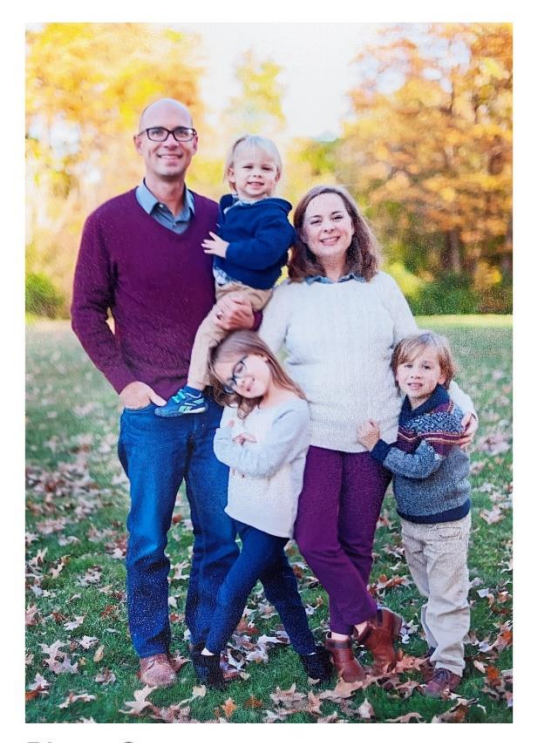
PhotoScan by Google Photos